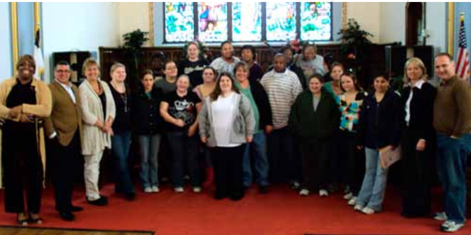
Over the course of two 10-week sessions, 32 parents have graduated from Baby University. Pictured below are the participants of the initial class and members of the South Toledo Advisory Committee.