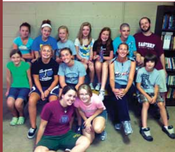
▲ Golden Ore. Some great junior high kids from Ore Creek Church in Michigan spent two days with us in August, serving a meal at the Sparrow's Nest and sorting clothing donations at LifeBridge Center. The group first came to Cherry Street in Summer 2010, deciding to return this year because they had such a positive experience blessing our guests! You're welcome back anytime, Ore!